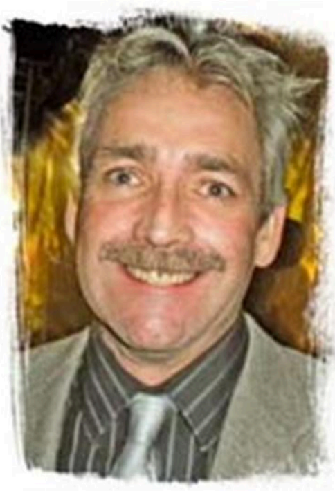
The greatest smile